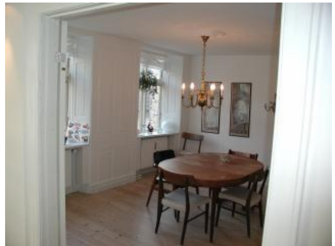
From living room to dining room