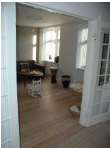
From Dining room to living room